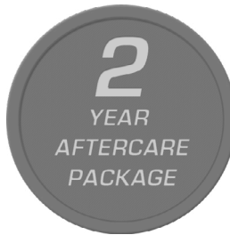
2 year aftercare package.