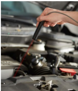
Infra-red temperature probe.