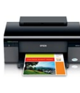
Wireless A4 colour printer.