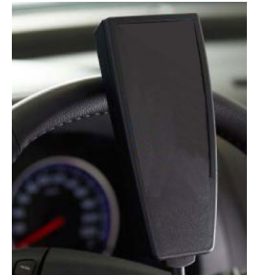
Wireless transmission RPM & temp probes.