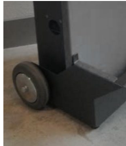
Mobile trolley with storage.