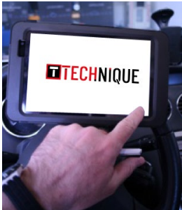
8" tablet with rubber protection.