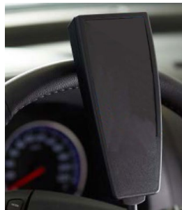
Wireless transmission EOBD scan tool.